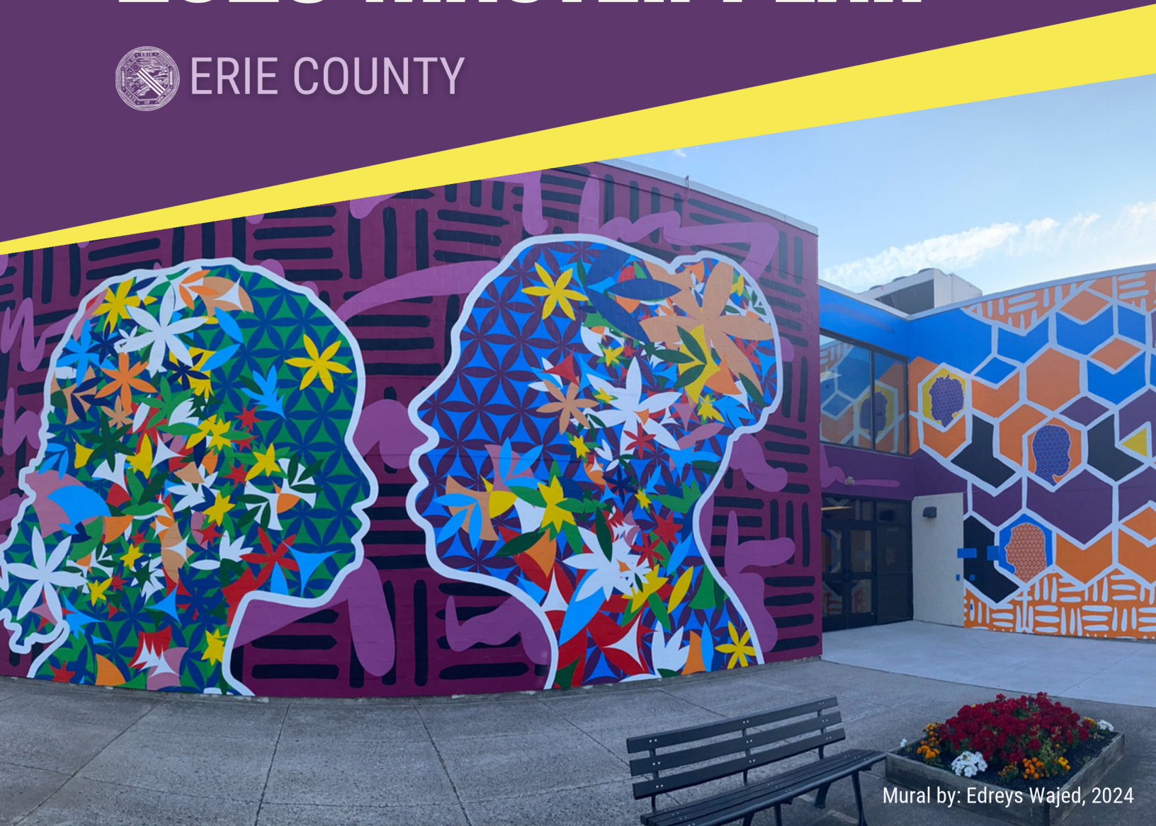
Mural by: Edreys Wajed, 2024