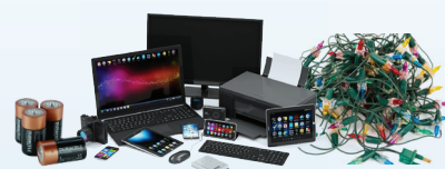
ELECTRONIC WASTE Electronics, Cords, Batteries, Christmas Lights