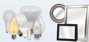
UNACCEPTABLE GLASS Light Bulbs, Plate Glass, Mirrors