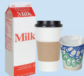
PLASTIC COATED FIBER