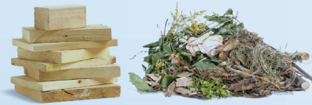
WOOD ITEMS, YARD WASTE