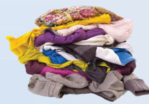
CLOTHING Clothes, Shoes, Boots, Hats, Blankets