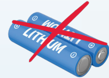
LITHIUM BATTERIES MAY CAUSE FIRES!