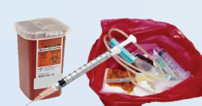
MEDICAL WASTE, SYRINGES