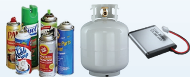
UNACCEPTABLE METAL Aerosol Cans, Propane Tanks, Paint Cans