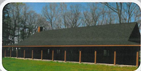
Evangola State Park