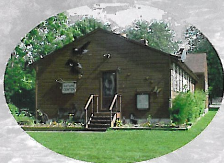
Fort Niagara State Park