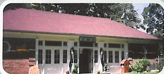
Beaver Island State Park

Nature Centers are open seasonally, July to Labor Day. Programs are available upon request. Call for more information.