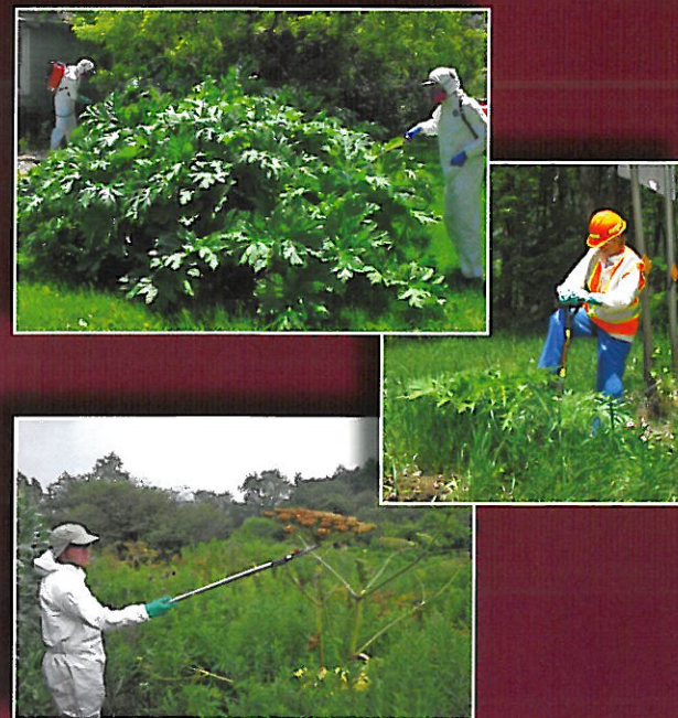
DEC workers conducting hogweed control

See more precautions at www.dec.ny.gov/animals/72556.html