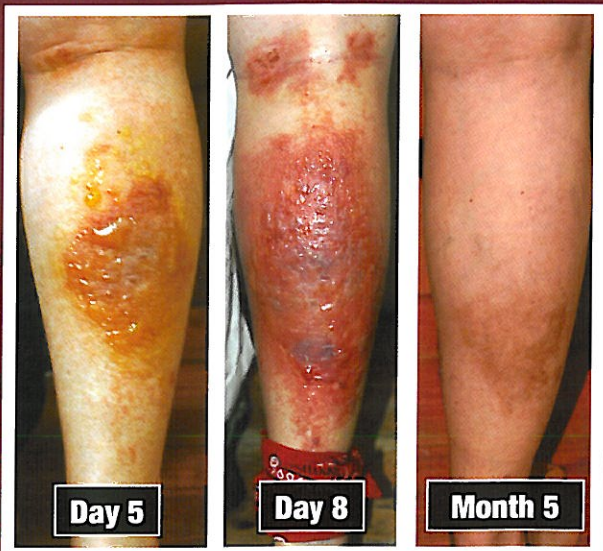
Example of a skin reaction to giant hogweed sap