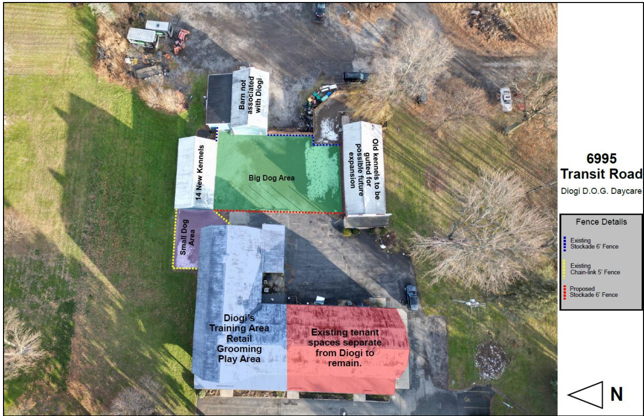
Diogi Daycare Site Plan