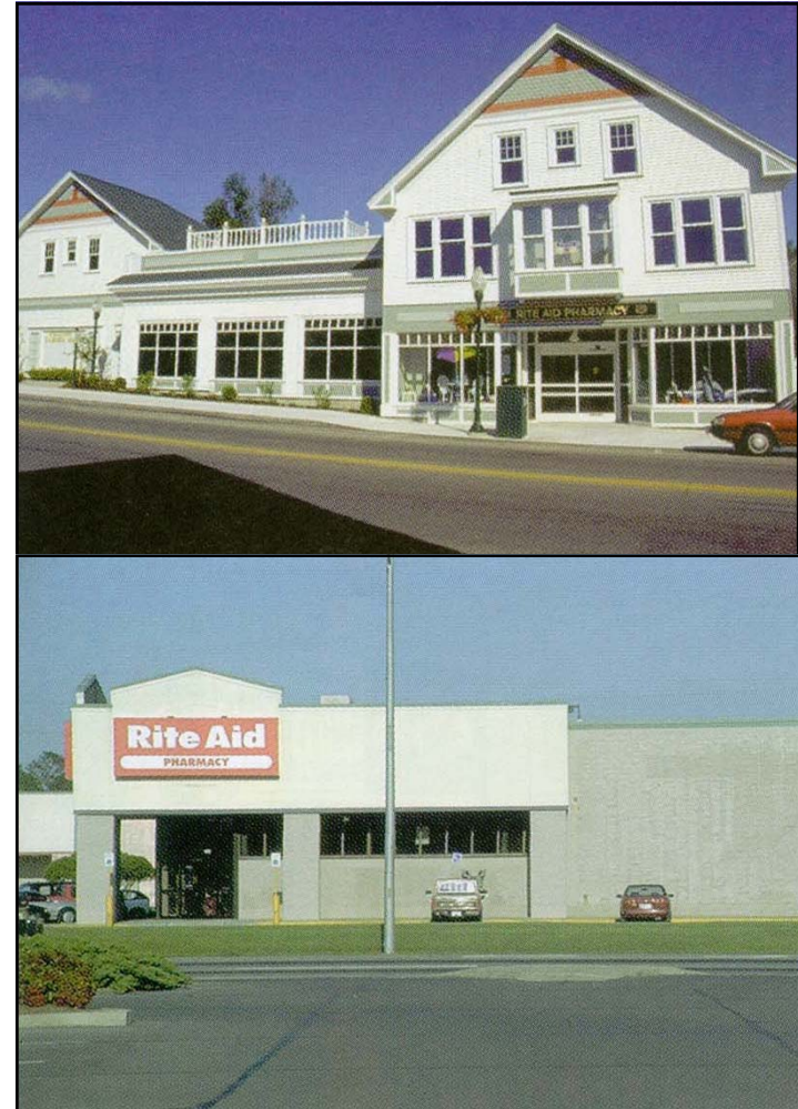
Figure II-2: Examples of the types of images used for the Preferred Development Survey, which allowed participants to identify favorable development for the Transit Road corridor. The top image was given a favorable rating and the bottom image was rated

During the process, a series of stakeholder meetings were conducted to ensure that the concerns and issues of specific groups, such as residents, businesses, elected officials, and emergency services, were heard. These meetings were held in order to identify a