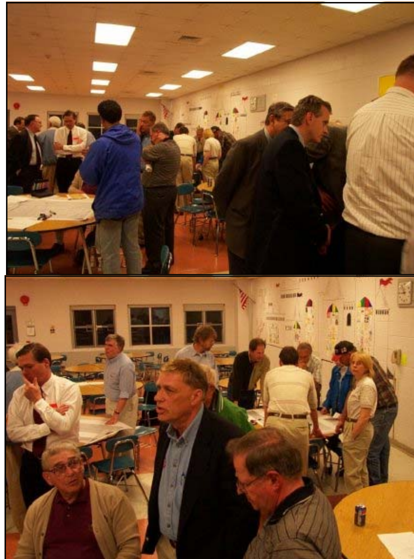
Figure II-1: Transit Road Public Meeting held in March 2002.

The report also contains recommendations for highway improvements such as medians, auxiliary turn lanes, median openings, future intersections, frontage/access roads, pedestrian accommodations, and local road improvements. Sketch plans that illustrate recommendations for improved access to existing businesses have also been produced for the developed portions of the corridor.