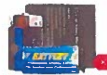
No Hazardous Waste or Batteries

© 2023 WM Intellectual Property Holdings, LLC. The Recycle Right recycling education program was developed based upon national best practices.