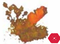
No Yard Waste