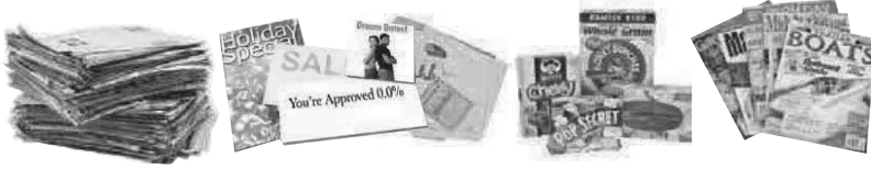
Newspaper, Office Paper, Paper Bags, Junk Mail, Paperboard & Magazines

Paper Place loose in cart. Use clear plastic bags for shredded paper ONLY .