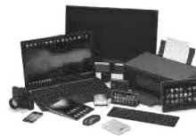
Electronics, Cords & Christmas Lights