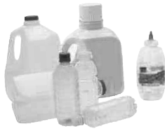
Jugs & Bottles with Small Top Openings