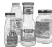
Clear Bottles & Jars