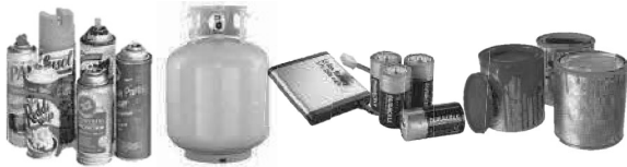
Aerosol Cans, Propane Tanks, Batteries & Paint Cans