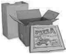
Cardboard & Pizza Boxes Flatten cardboard. Remove wax paper from pizza boxes