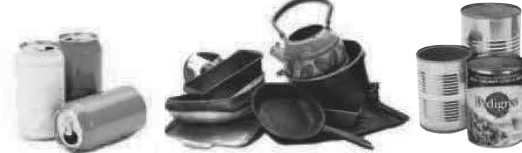
Aluminum Cans, Metal Cookware, Steel & Tin Cans