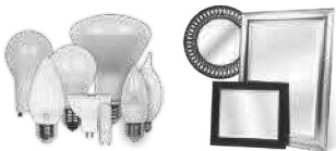
Light Bulbs & Plate Glass/Mirrors